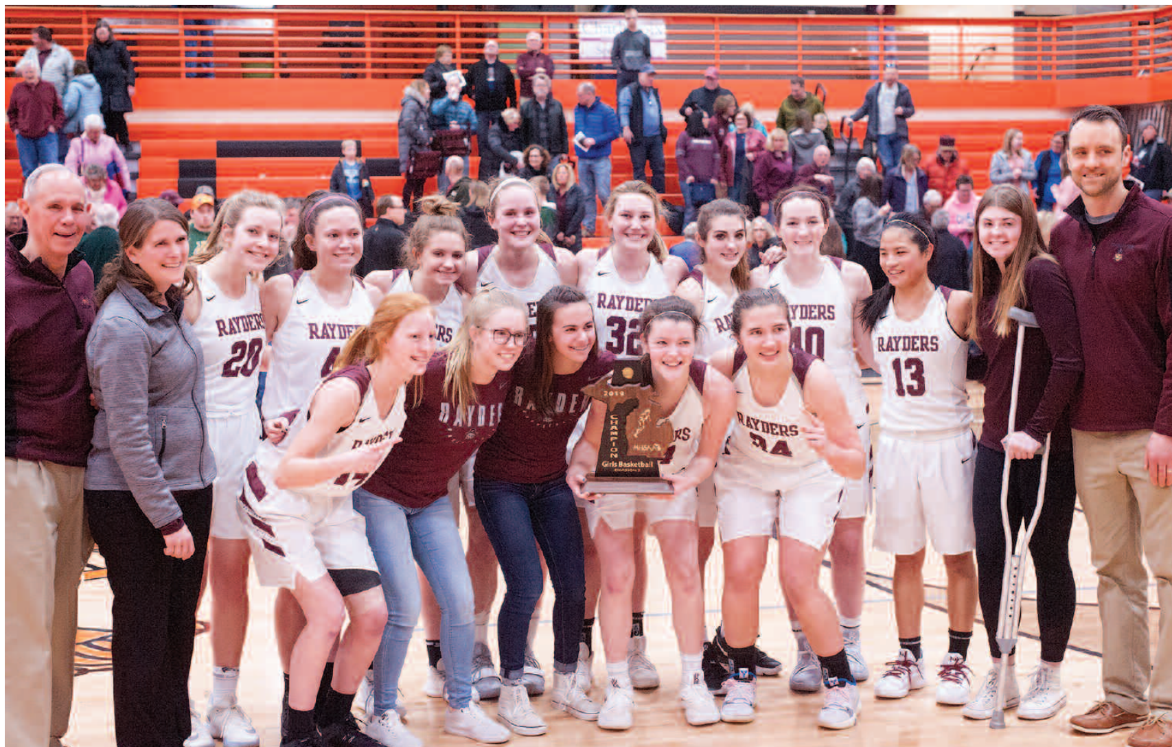
The 2019 Division 3 district Champion Charlevoix Rayders.